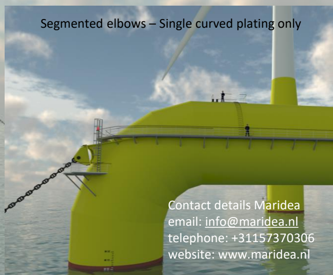
Segmented elbows – Single curved plating only

Contact details Maridea email: info@maridea.nl telephone: +31157370306 website: www.maridea.nl